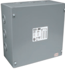
Shown With Cover